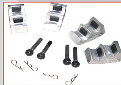
Jaws for alloy wheels

For a video demonstration see Form 5222T.